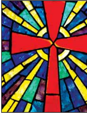
Left: Stained Glass Window inside Staples UMC

Now these scholarship funds are invested in the Methodist Loan Fund through the Texas Methodist Foundation, along with a building fund established in anticipation of a land purchase or further renovations required to keep up with the demands of